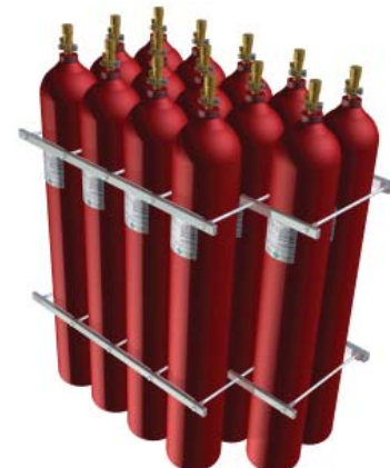
Typical Cylinder Rack Assembly (Assembly IG71-016-410 shown)