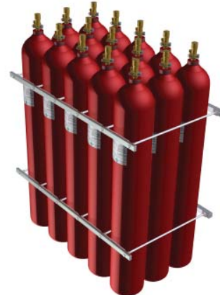
Typical Triple - Row Cylinder Rack Assembly (Assembly IG71-016-500 shown)

Triple-row cylinder mounting may be used when it is necessary to have up to 15 cylinders in a single storage rack. A triple-row cylinder storage rack utilizes Unistrut and threaded rod to secure the cylinders. The assembly part numbers include all the hardware required to assemble the racking and secure the cylinders. The installer must provide the fixings necessary to secure the rear support Unistrut to the mounting structure.