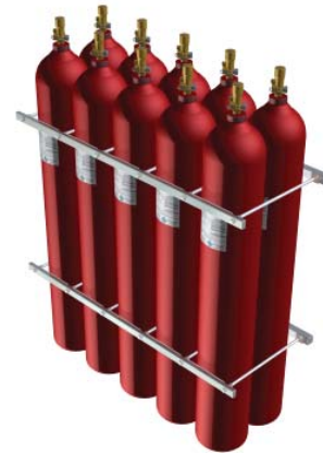
Typical Double - Row Cylinder Rack Assembly (Assembly IG71-016-050 shown)

Double-row cylinder mounting may be used when it is necessary to have up to 10 cylinders in a single storage rack. A double-row cylinder storage rack utilizes Unistrut and threaded rod to secure the cylinders. The assembly part numbers include all the hardware required to assemble the racking and secure the cylinders. The installer must provide the fixings necessary to secure the rear support Unistrut to the mounting structure.