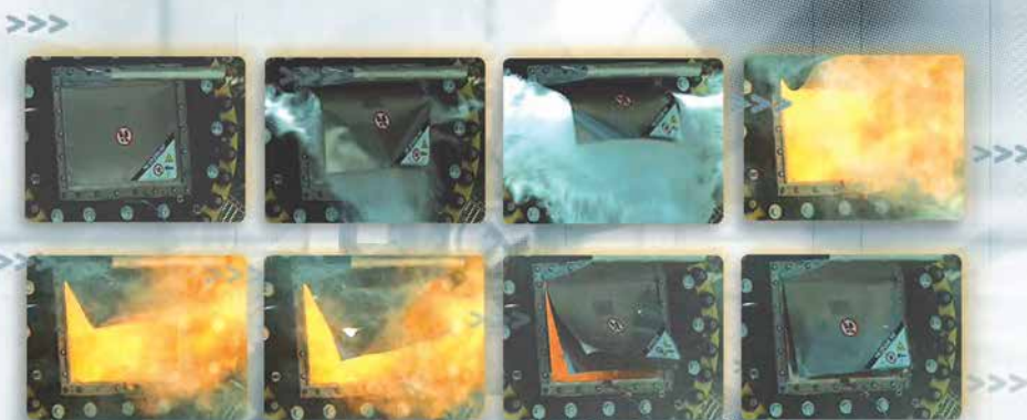
Vent re-closing sequence

The Flex-V opens to prevent explosion damage and re-closes to limit available oxygen that could fuel a resulting fire.